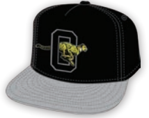
BLACK / GREY