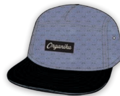
CHAMBRAY / BLACK