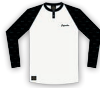
WHITE / BLACK