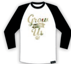
WHITE / BLACK