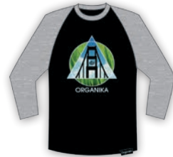
BLACK / ATH HEATHER