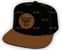
BLACK / BROWN