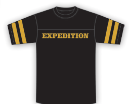
BLACK / VINTAGE YELLOW