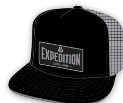
BLACK / GREY