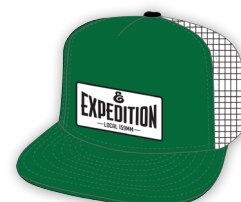
FOREST GREEN / WHITE