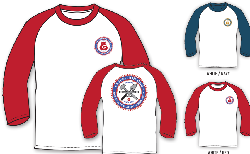
WHITE / NAVY

100% Cotton 3/4 Raglan Jersey Regular Fit Chest Print Art, Back Print Art Water Based Screen Print