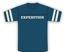
NAVY / CREAM