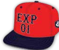
RED / NAVY