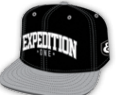
BLACK / ATH HEATHER