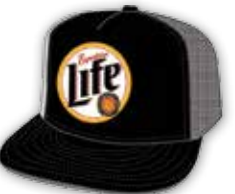
BLACK / WHITE