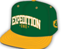
FOREST / GOLD