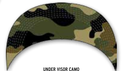
UNDER VISOR CAMO